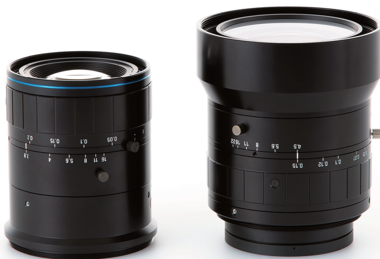
Image circle \phi 75mm, line scan macro lens with short focal length

Ensures illumination uniformity from the center to the edge of the lens